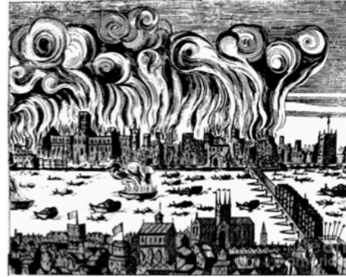
The Burning of London by Samuel Rolle: