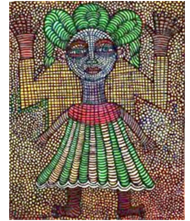
Small girl by Ephrem Kouakou