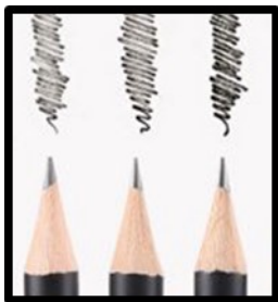
Pencils HB 8B 4B