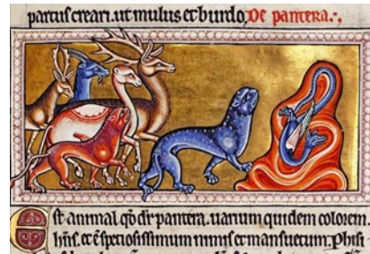
Animal Imagery in Middle Age manuscripts