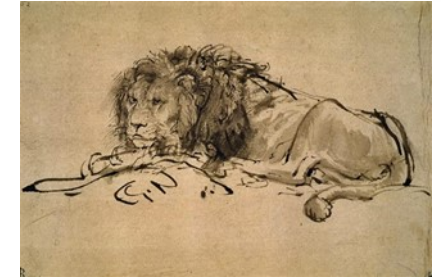
Recumbent Lion by Rembrandt